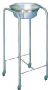
Single and Double Bowls available with choice of H-Brace (left) or Shelf (right)