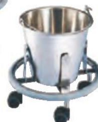
Kick Bucket and Frame