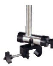
Rotating C-clamp system makes this IV pole versatile